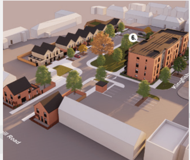
Number 6 shows Phase 3

Outline planning permission was granted in 2020 for a third phase of development at John Barker Place to provide 49 new affordable homes on the site of Freemans Close. We're currently preparing the reserved matters application which will be submitted to North Herts Council in March this year. Subject to approval, work will begin on site in 2023, once Phase 2 is complete. The proposed properties will provide a mixture of social rent and shared ownership homes which we expect to be completed in 2025.