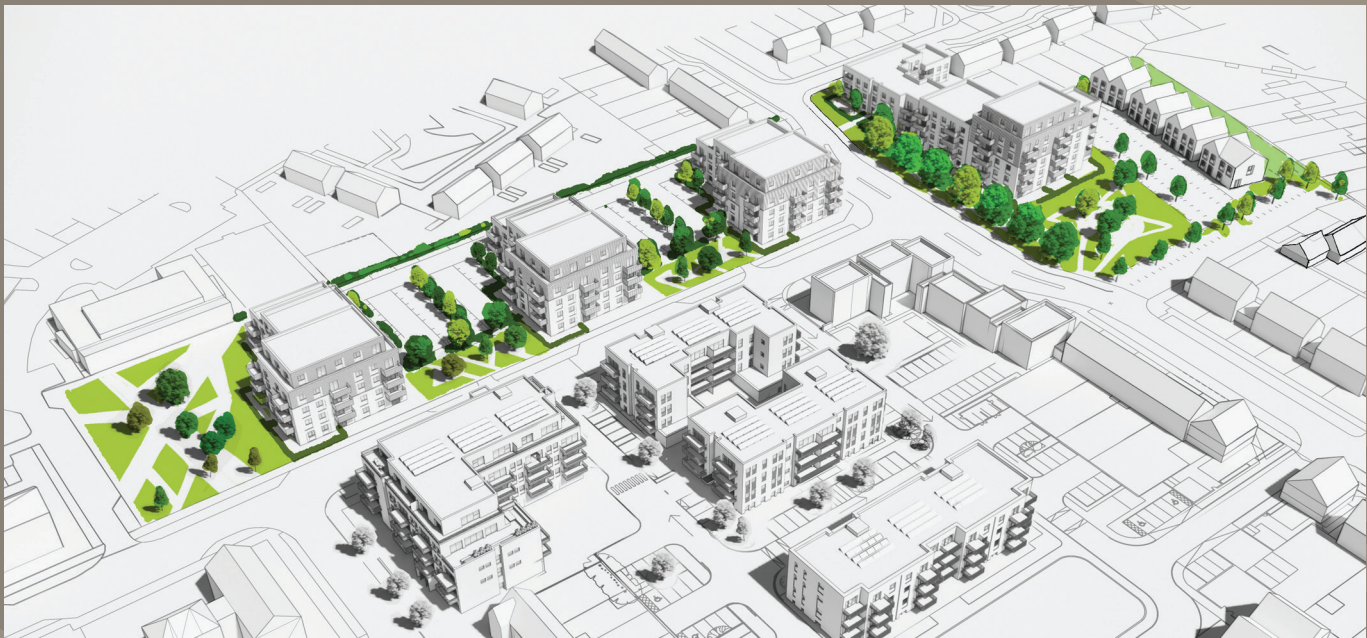
3D view of plans for John Barker Place, Westmill Road & Westmill Lawns

The Resident Steering Group continue to meet monthly to share feedback and queries from residents on the redevelopment of homes at John Baker Place. If you are interested in joining or wish to give your feedback, send us an email to johnbarkerplace@settlegroup.org.uk .